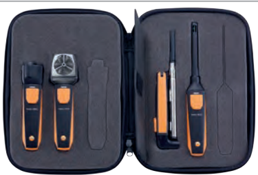
VAC Smart Probe Kit: 0563 0003