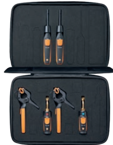
AC/R Test & Load Kit: 0563 0009