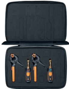
AC & Refrigeration Kit: 0563 0002 20