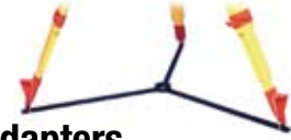
60-TFG20 Floor Guide