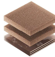
1500CI Corrosion Intercept