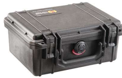
1150NF No Foam