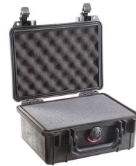
1150WF With Foam