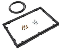
1150PF Special Application Panel Frame