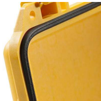
1153 Replacement O-ring