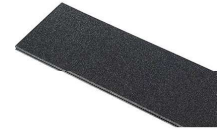
1150TPDIV Extra TrekPak Dividers