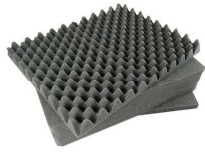
1151 3 pc. Replacement Foam Set