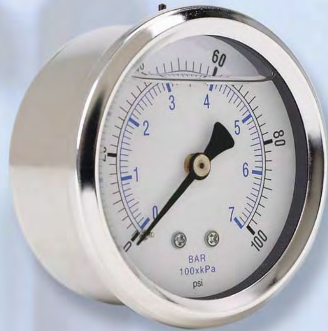
▲ MODEL 251C4