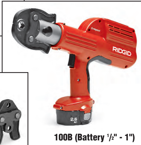
100B (Battery 1/2" - 1")