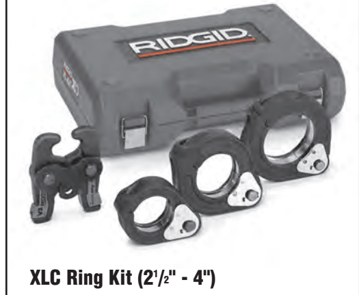
XLC Ring Kit (2 1/2" - 4")