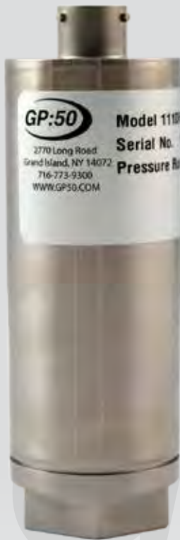
Model 111 / 211 / 311 Industrial Grade Pressure Transducer