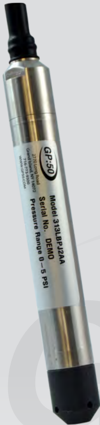
Model 313L Submersible Level Transmitter