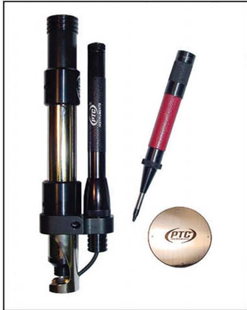
Model 316 shown above