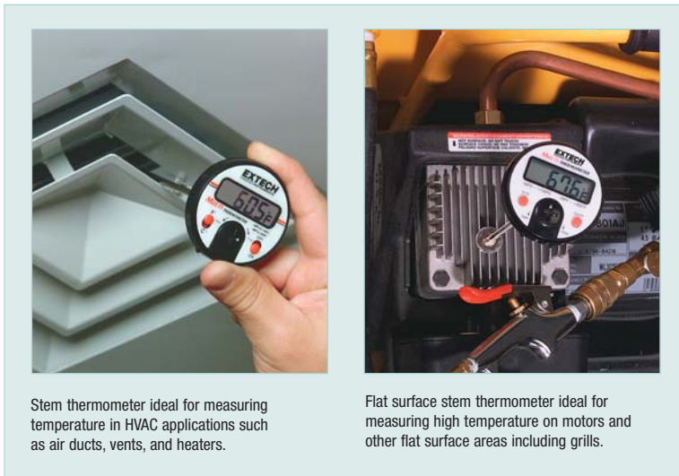
Stem thermometer ideal for measuring temperature in HVAC applications such as air ducts, vents, and heaters.