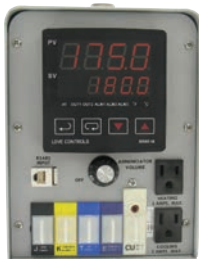
Portable Housing Model 4B-33-986/U