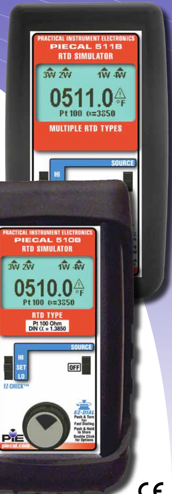
Actual Size (Shown with optional boot)

* PIECAL Calibrators are not manufactured or distributed by Fluke Corp or Altek Industries Inc, manufacturers of Altek Calibrators.