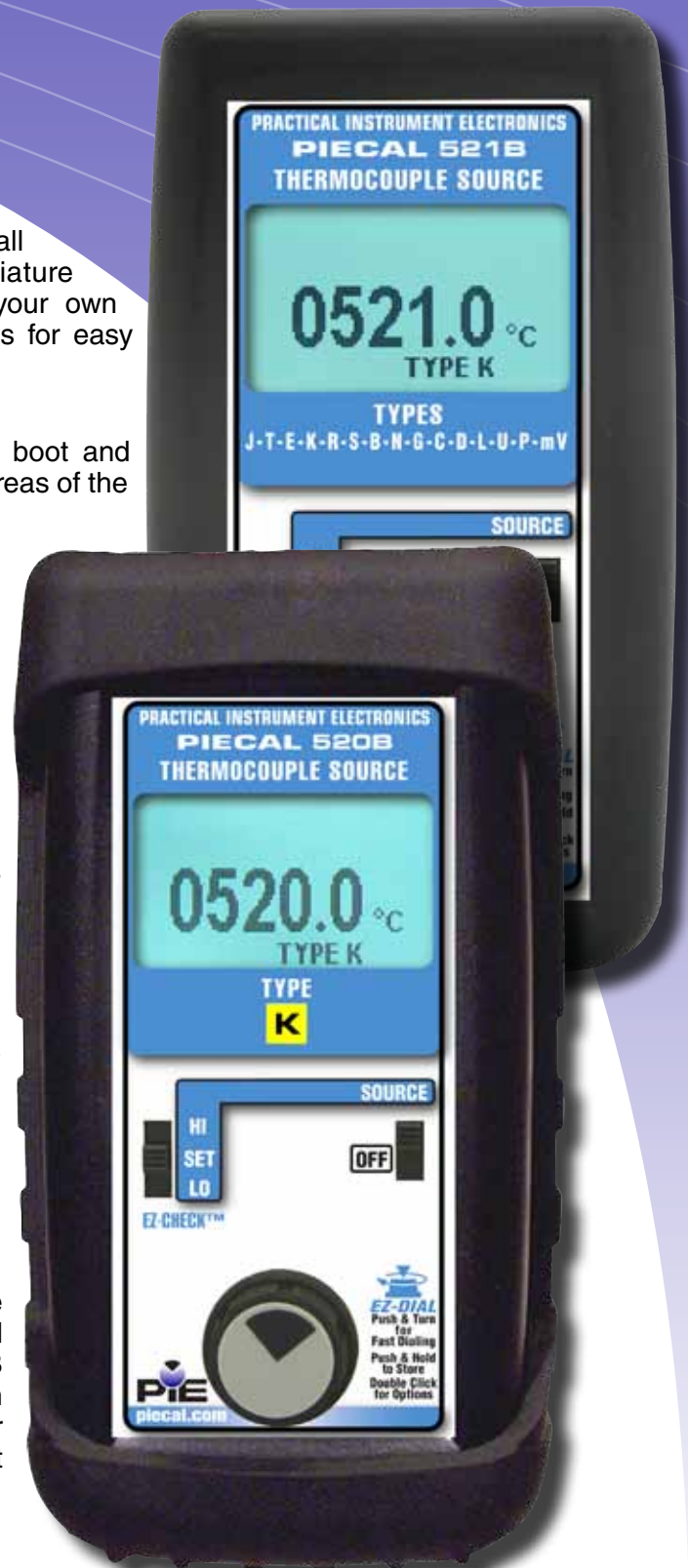
Actual Size (Shown with optional boot)

* PIECAL Calibrators are not manufactured or distributed by Fluke Corp or Altek Industries Inc, manufacturers of Altek Calibrators.