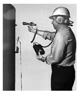
Locating a leak in an air pressure tank