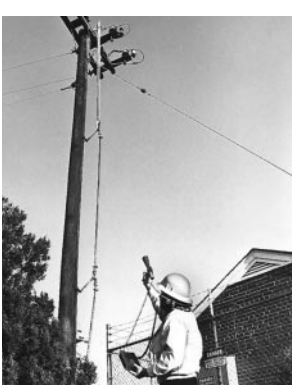
The detector is excellent for patrolling pole lines.