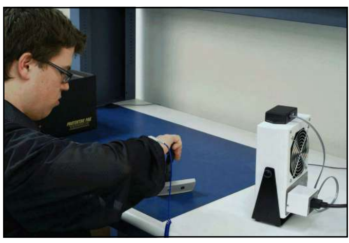
Figure 4. Using the Ionizer Motion Sensor with the 60505 High Output Benchtop Ionizer

Leave the sensor's field of view to activate the shutoff delay timer. The Ionizer Motion Sensor's LED will turn off and unpower the ionizer once the preset deactivation delay time is reached.