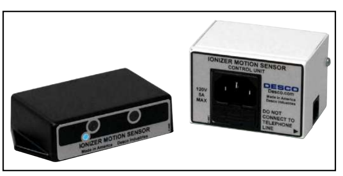
Figure 1. Desco 60509 Ionizer Motion Sensor