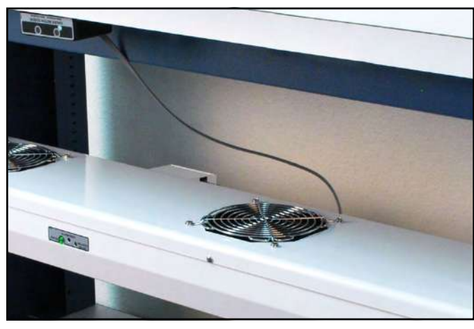
Figure 5. Using the Ionizer Motion Sensor with the 60473 Chargebuster® 3-Fan Overhead Ionizer