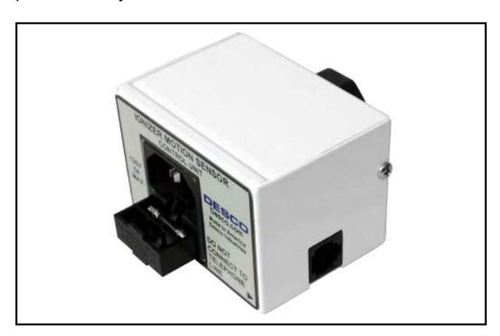
Figure 6. Replacing the fuse in the Control Unit

The fuse located in the Control Unit may be replaced by removing the power cord and opening the fuse drawer at the IEC inlet. The Control Unit uses one 5A, 250V slow blow fuse. DO NOT use other ratings as it may pose a safety hazard.