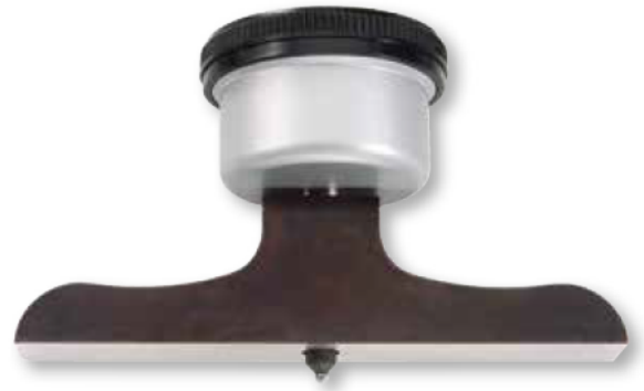
Above: 642AZ side view Below: top view