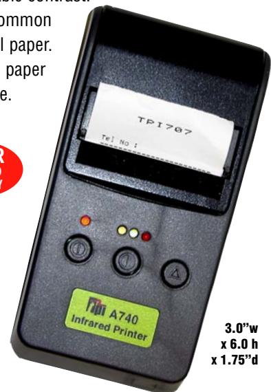
3.0"w x 6.0 h x 1.75"d