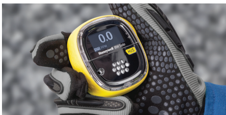
Easy to handle