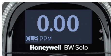
Easy to read