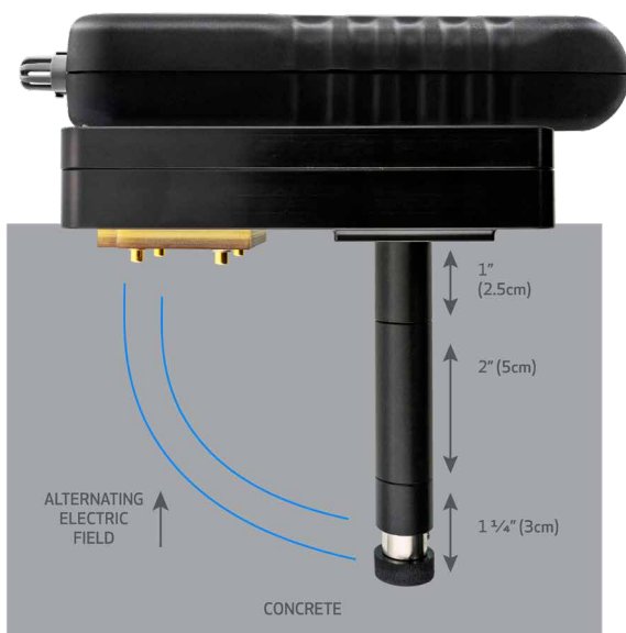
CONCRETE MOISTURE ENCOUNTER

The Determinator Probe and CMEX5 allow for a unified gravimetric-based testing method of moisture content both on the surface and within the body of the concrete. %MC readings for both the in-situ and the non-destructive surface tests eliminate confusion between different testing method data. The Determinator conductive probes are reusable, extendable, and require no plastic hole liners. The hole diameter required is the same for the Hygro-i2 RH test as per F2170.