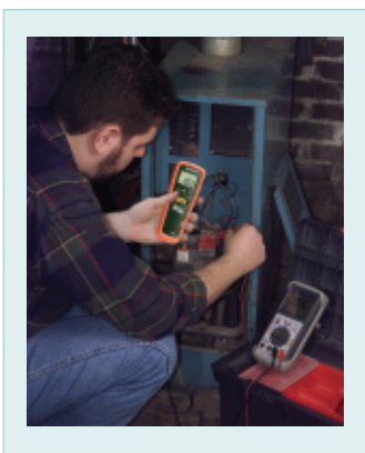
Ideal for performing service checks on furnaces and hot water heaters