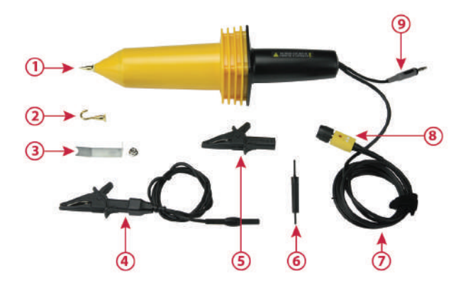
Figure 1: CT4026 Probe Accessories