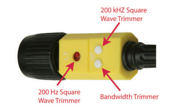
Figure 2: Frequency Compensation Trimmer