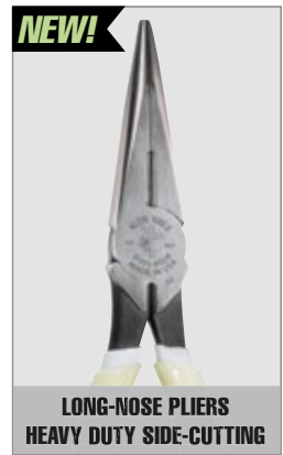
LONG-NOSE PLIERS HEAVY DUTY SIDE-CUTTING