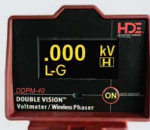
Peak Hold Mode