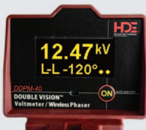
Phase Angle Display