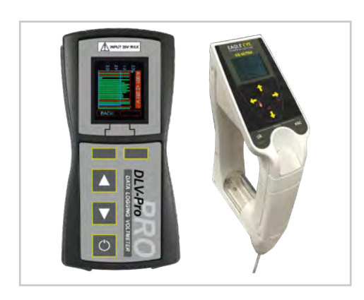
DLV-Pro Voltmeter & SG-Ultra Digital Hydrometer