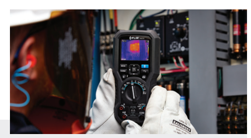
DESIGN AND FUNCTIONALITY