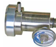
Demand flow regulator