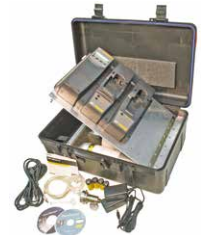
MicroDock II portable system kit