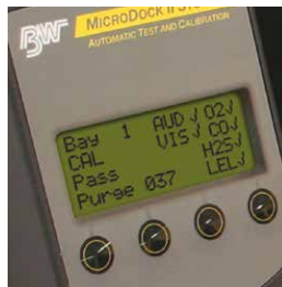
*Available with Honeywell IntelliDoX in 2019