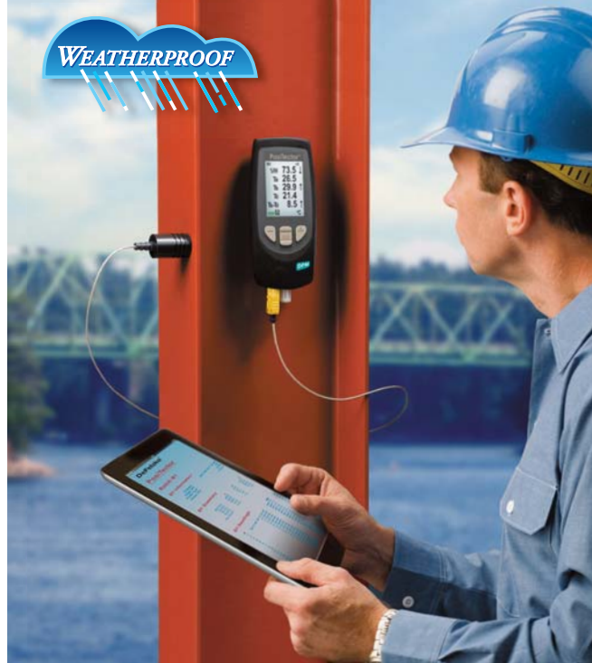
Analyze uploaded readings using a web browser from anywhere – jobsite or head office.