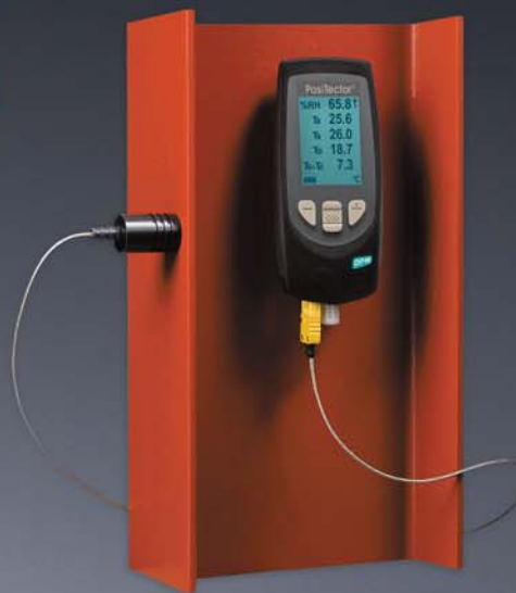
Standard model shown with separate probe

Relative humidity, air temperature, surface temperature, dew point temperature and difference between surface and dew point temperatures. Ideal for surface preparation as required by ISO 8502-4.