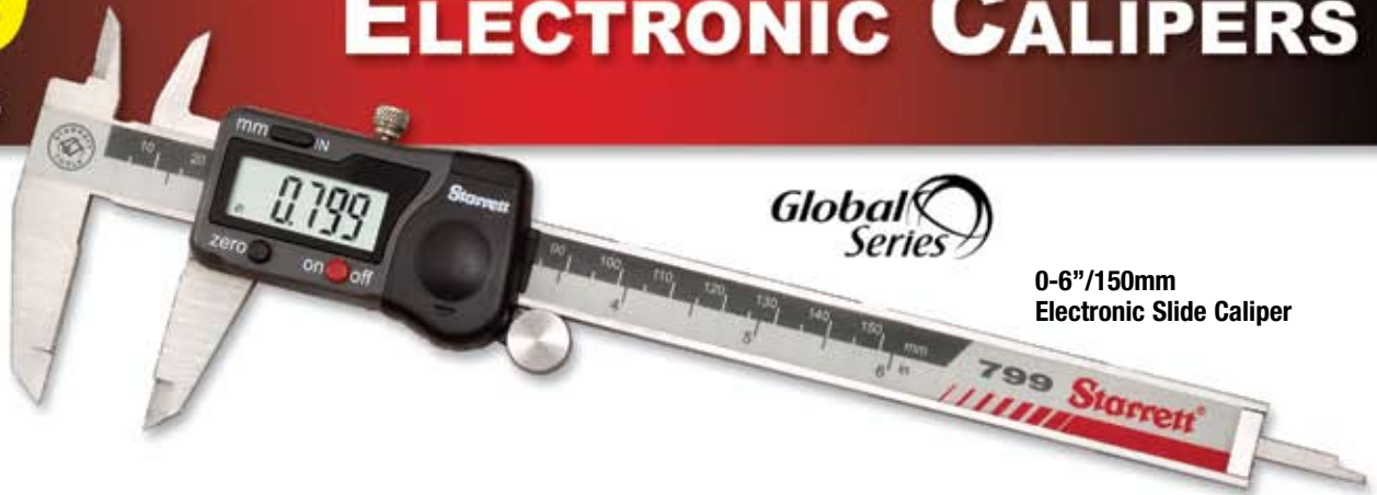
0-6" / 150mm Electronic Slide Caliper

Starrett's 799 Series Electronic Calipers are light, comfortable, easy-to-use, and include features that have made Starrett Slide Calipers the machinist's first choice for many years.