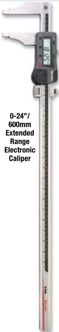
0-24" / 600mm Extended Range Electronic Caliper