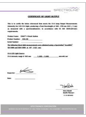
CERTIFICATE OF LIGHT OUTPUT