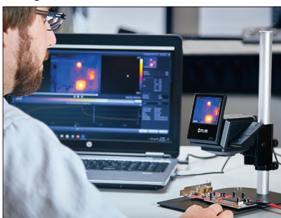
Connect over USB a computer to analyze data in FLIR Tools+