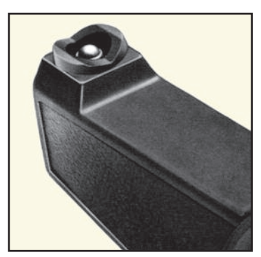
Carbide measuring probe for long life.