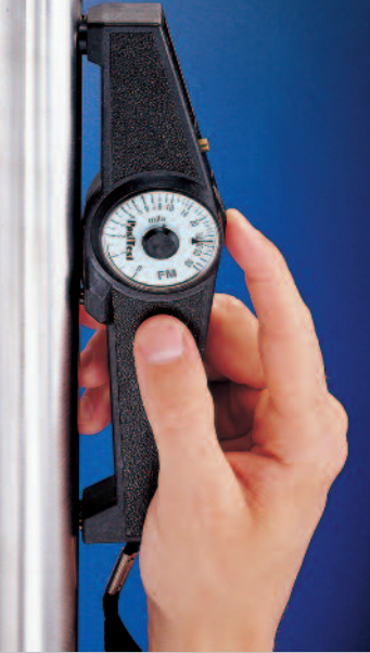
Stable design with additional tail-end support. No annoying rocking during measurement.