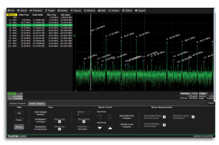
Spectrum Analyzer software uses oscilloscope channels, zooms, math functions or History Mode as source waveforms.