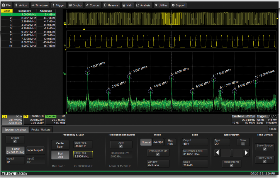
Spectrum analyzer style controls simplify waveform analysis in the frequency domain