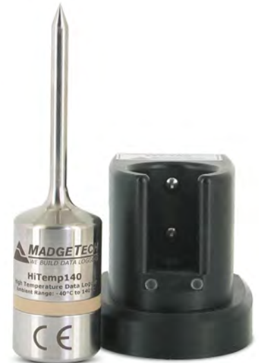
IFC400 (sold separately)

Using the MadgeTech Software, starting, stopping and downloading the HiTemp140 is simple and easy. To use, simply place the HiTemp140 in the IFC400 or IFC406 docking station (sold separately). Using the software, an immediate or delay start can be chosen, as well as the reading rate. Start the data logger, remove it from the docking station and the device is ready to be deployed. Graphical, tabular and summary data is provided for analysis and data can be viewed in °C, °F, K or °R. The data can also be automatically exported to Excel® for further calculations.