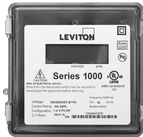
Outdoor NEMA 4X Enclosure