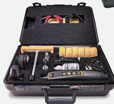
Complete Kit shown