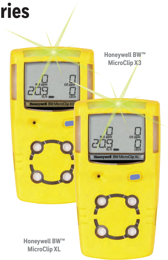
Honeywell BW™ MicroClip XL

For a complete list of kits and accessories, please contact Honeywell Analytics.