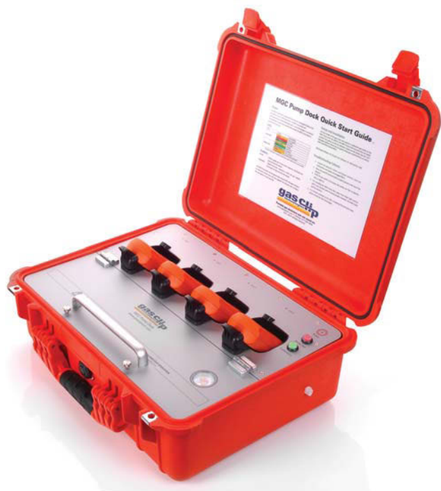
MGC Pump Dock