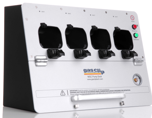
MGC Pump Wall Mount Dock