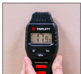
Moisture Meter (pin/pinless)