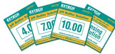
PH103 includes 6 pouches each of pH 4, pH 7, and pH 10 Buffers plus 2 Rinse solutions