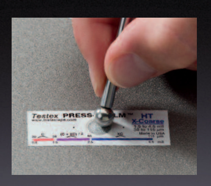
For use with Testex™ Press-O-Film™ Replica Tape

Digital spring micrometer measures and records peak to valley surface profile height using replica tape