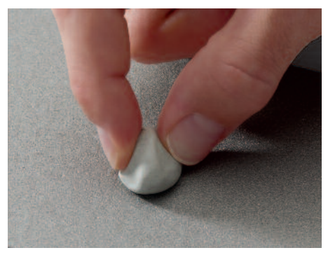
Test Surface Cleaning Putty included

Advanced model display shown in Memory Mode