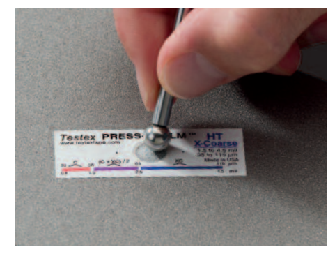
Stainless Steel Burnishing Tool ensures consistency