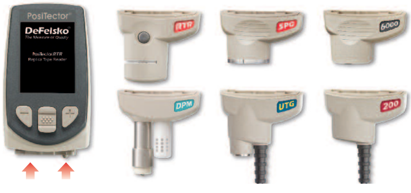
PosiTector bodies accept all 6000, 200, DPM, UTG, SPG and RTR probes