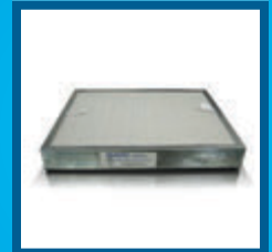
F074 Medical Grade HEPA