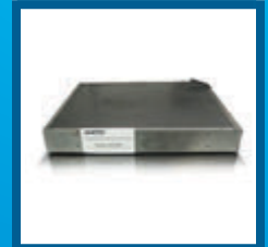
F072-GPC Chemical Filter

Air Flow: 510 m 3 /h / 300 CFM Motor(s): Motorized impellers, backward inclined, non-overloading Voltage: 120V or 230V Dimensions: 13"W x 16"D x 20"H / 330mm x 406mm x 508mm Filter Sequence: 2" Pleated pre-filter, 30% ASHRAE (F071) 2" Medical grade HEPA Filter 99.97% (F074) 2" Chemical filter (F072-GPC) Optional Inlets: 3", 4" or dual 3" diameter Discharge: Recirculation grille Sound Level: 54 dBA at full speed Remote Control: Optional Suction hose: 6 feet (2m) of heavy duty hose & clamps