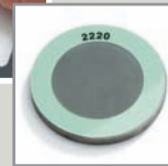
Individual plates are available