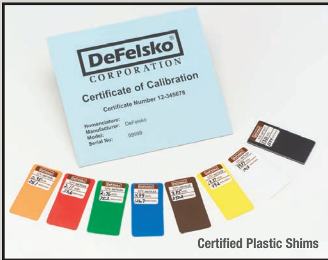
Certified Plastic Shims