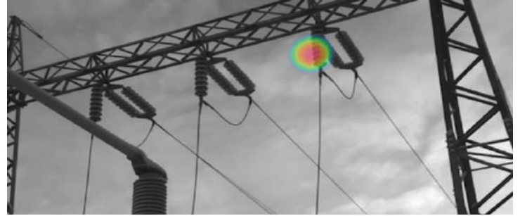
Example of Si124 PD severity assessment