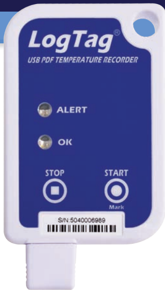
Rated Absolute Accuracy