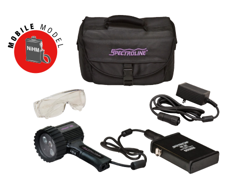
uVision™ 365 AC/DC MOBILE KIT