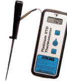
Platinum RTD Dial Thermometer