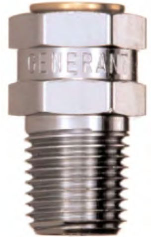
VRV Vent to Atmosphere

(based on sealing selection, see ordering information)