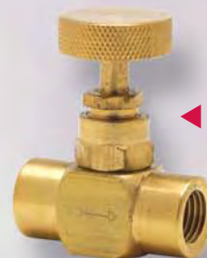
◀ MODEL BBV4

Brass, 1/4" NPT female connections only. Suitable for 600 psi at 300° F maximum; for water, oil or gas service.