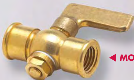
◀ MODEL A12

1/4" NPT female connections. In polished brass suitable for pressure to 200 psi hydraulic. Specify Type A12 .