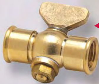
◀ MODEL A10

In polished brass (suitable for pressure to 125 PSI hydraulic) Specify Type A10 1/4" NPT female connections. A11 1/4" NPT male x female