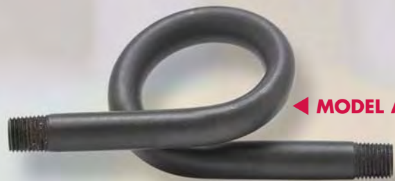
◀ MODEL AO31

Schedule 40 Steel (for max. 500 PSI and 400°F) Specify Type AO31 . 1/4" NPT. Brass (for max. 250 PSI and 400°F specify type AO3B ).