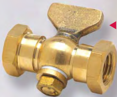
◀ MODEL A10E

In polished brass for pressures to 200 psi hydraulic, 1/4" NPT female connections with hex shoulders.